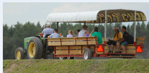
Wagon Rides & Cranberry Marsh Tour