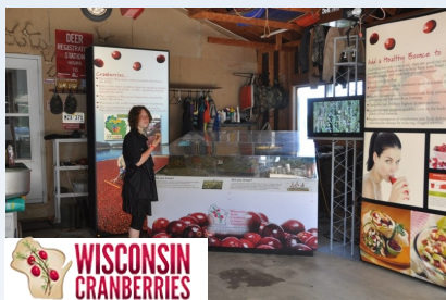
The WI State Cranberry Growers Assoc.