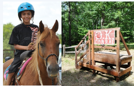
Horseback Riding at the O.K. Coral