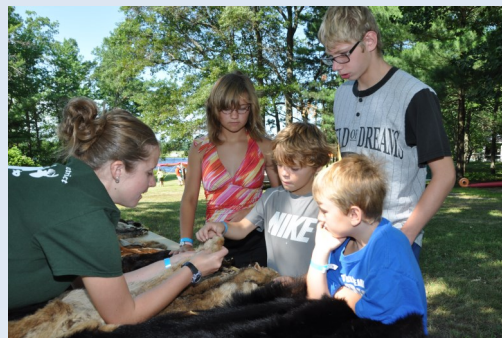
Wisconsin DNR Animal Hides