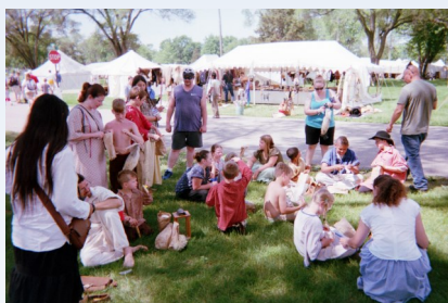
Big River Long Rifles