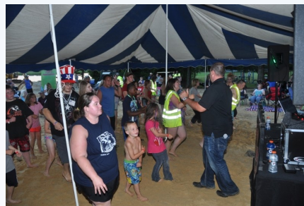
Into the evening, the fun never stops!