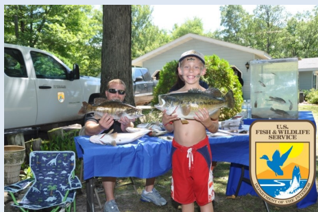
Genoa National Fish Hatchery

Note: At check-in you will be given a schedule and map for ALL exhibits and activities.