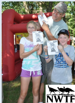
NWTF Laser Shoot