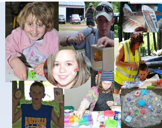
Art & Crafts